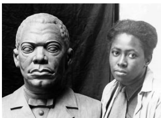
Burke with her sculpture of

Edited from https://www.womenshistory.org/education-resources/biographies/selma-burke