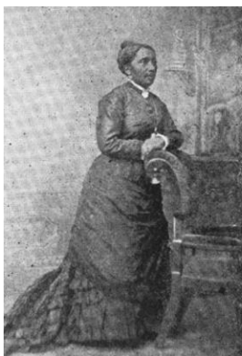
Elizabeth Jennings Graham

Before Rosa Parks, there was Elizabeth Jennings Graham