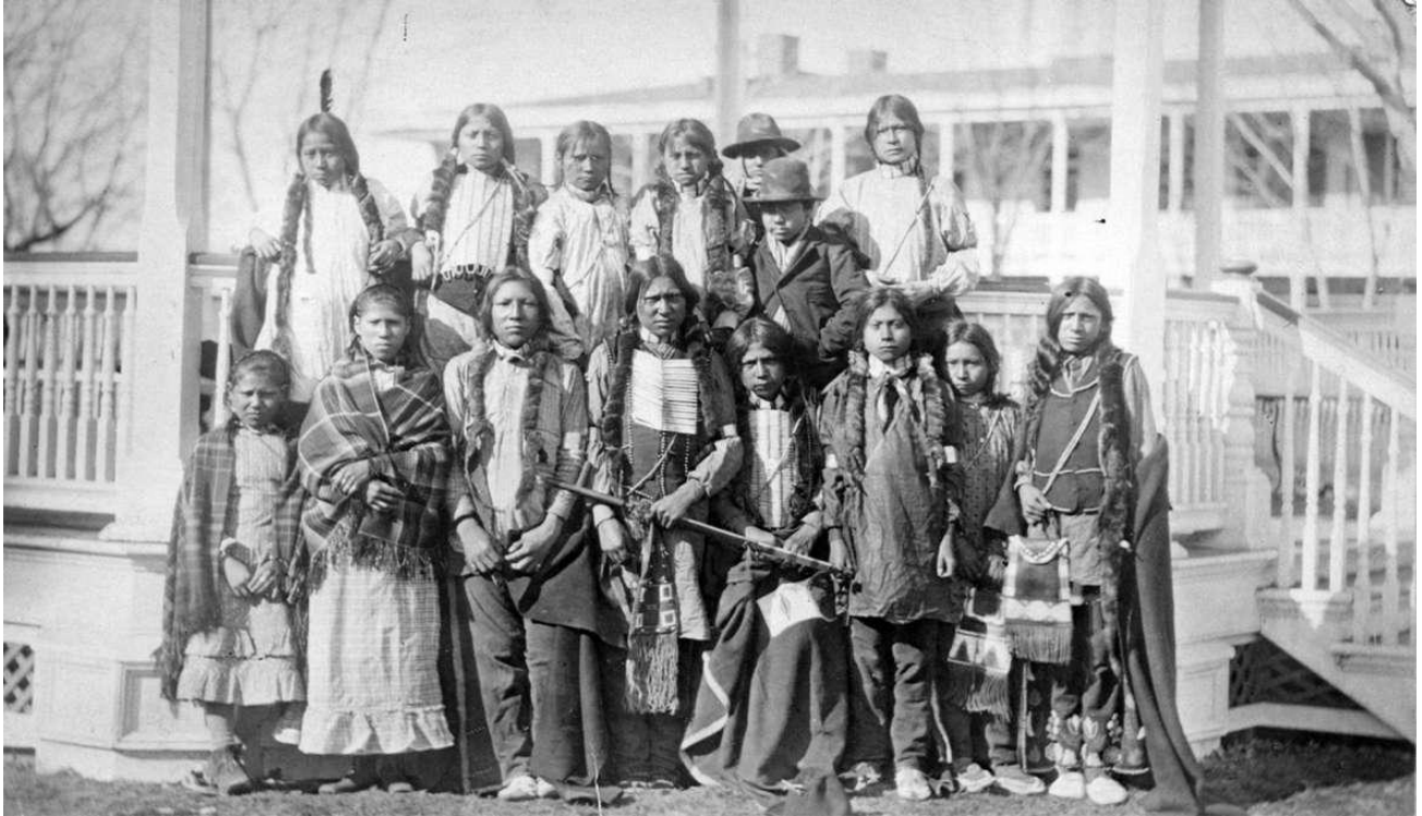
Northern Arapaho and Eastern Shoshone students at the Carlisle Indian School, 1881, shortly after their arrival from Wyoming Territory. Soon, the boys' braids would have been cut and they would no longer have been allowed to wear traditional dress. The two boys in hats are reportedly Shoshone.