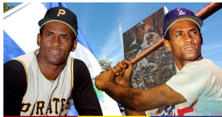
Roberto Enrique Clemente Walker